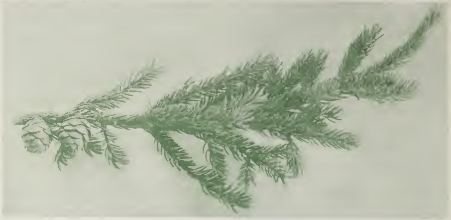
Black spruce. (About one-third natural size)